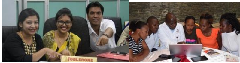
Participants at Chitwan Medical College, Nepal, 2018; MR team at Nairobi Hospital, 2018