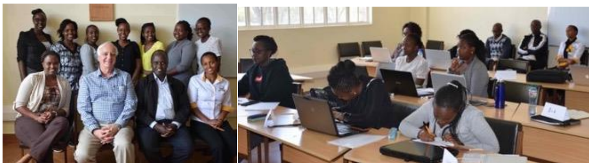
MR graduates at Kabarak University, 2019; MR participants at Kabarak University, 2019