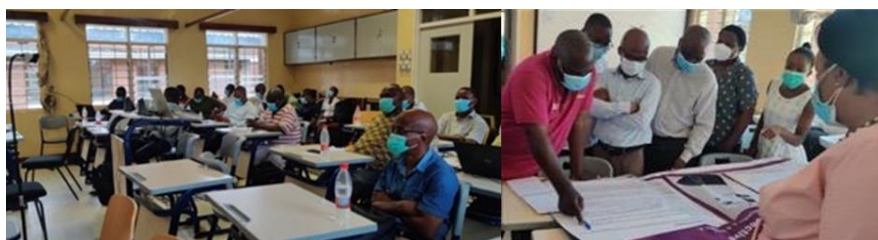
MicroResearch Workshop in Mangochi, Malawi – February, 2021