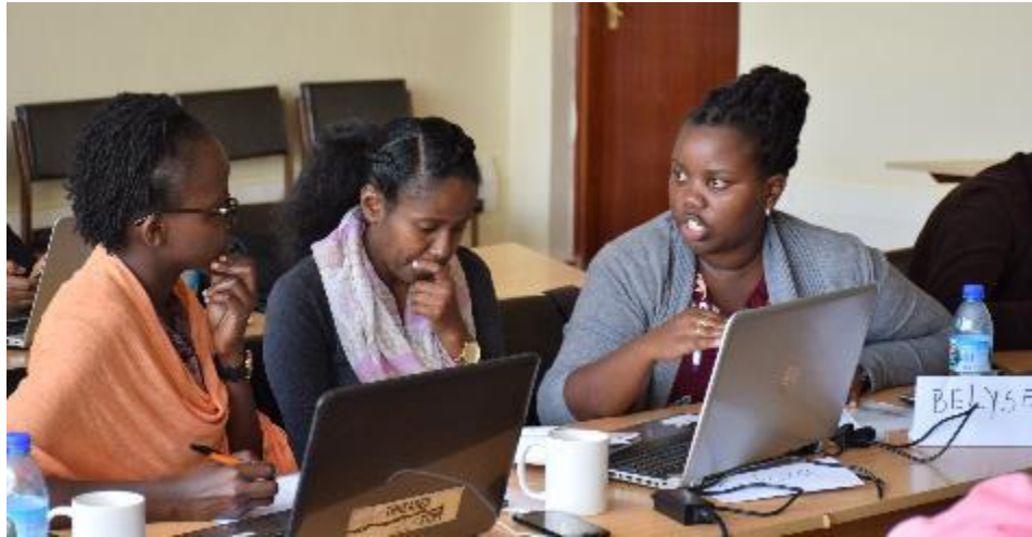
Participants at Kabarak Workshop May 2019