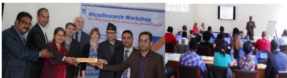
MicroResearch Workshop at Medical College, Nepal 2017; MicroResearch Workshop at KABU, 2017