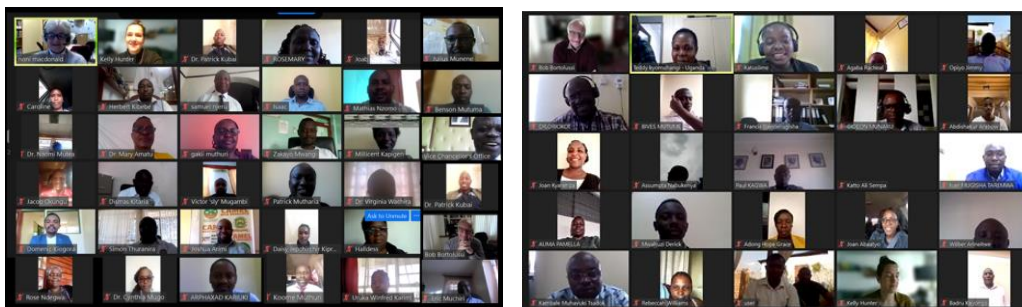
Participants at MR Virtual Workshops for Meru University of Science and Technology, January 2023 and Mbarara University of Science and Technology, February 2023