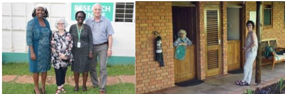
MicroResearch Workshop at Mildmay Uganda, 2019