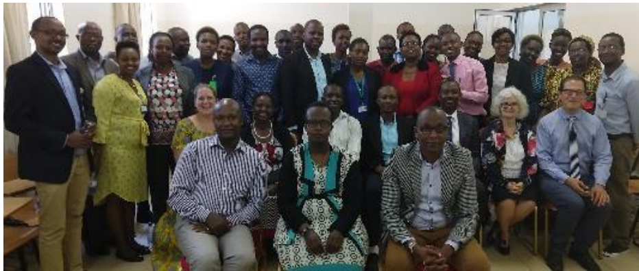
MicroResearch Workshop Class CHUK with teachers, coaches and judges. Kigali, Rwanda 2018

“MicroResearch was eye opening, and I am positive that it will change my life.”