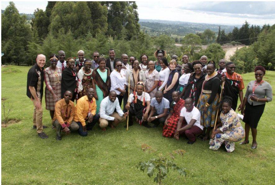
Participants from MicroResearch workshop with Kenya Medical Training College in Kapenguria, Kenya, November, 2023 All photos in this book are used with permission

Training Graduates & Research Projects January 2024