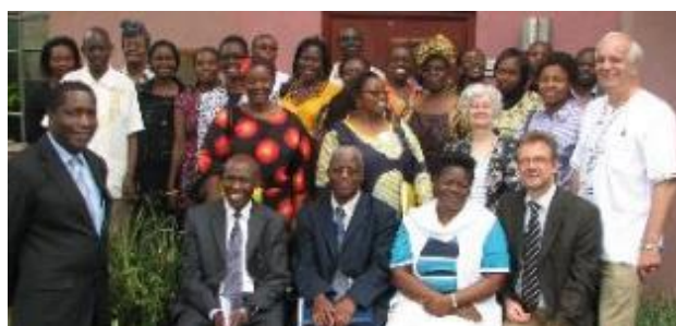
MicroResearch Workshop 2012 University of Nairobi

“You have made it possible for me to meet the people I should have met 5 years ago, who can help me in my research.”