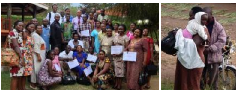
MicroResearch workshop Mbarara, Uganda 2013; Mother and child arriving at clinic, Busheyini District Uganda

“Small projects are the cornerstone on which research skills are built and wider spectrum of potential researchers reached with excellent outcomes.”