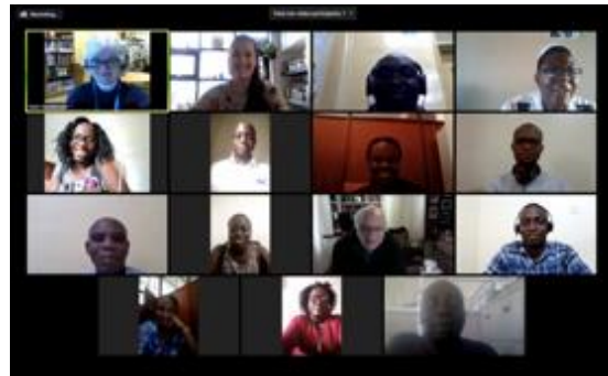
Left: MR Virtual Writing Workshop, with participants from Guyana, Rwanda, Kenya, and Uganda – November 2020