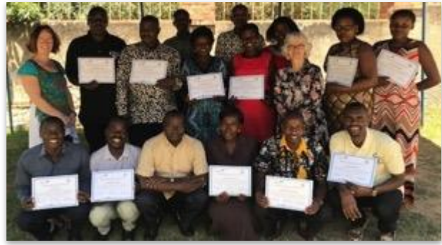
MicroResearch Writing Workshop, MUST Uganda, June 2019; MicroResearch Writing Workshop, MUST Uganda, February 2020;