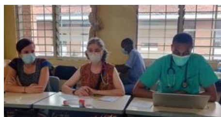
Judges at the Malawi workshop – February, 2021