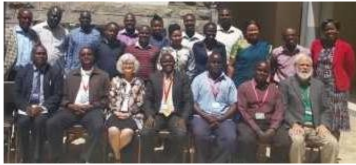
MicroResearch Thesis Workshop at Kabarak University, Kenya – May, 2017