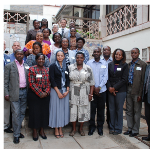
MicroResearch Workshops over the years