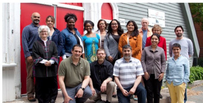
MicroResearch NS workshop class - 2017

For more information on the MicroResearch Nova Scotia/Canada program, visit www.microresearch-international.ca .