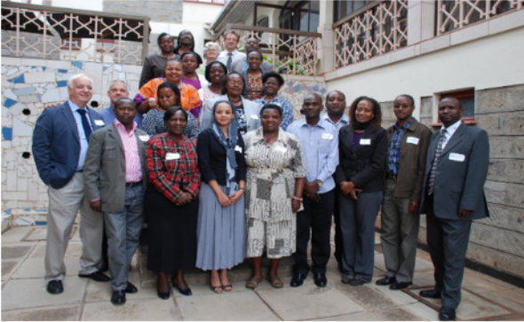
MicroResearch Forum in Nairobi, Kenya - 2013

MicroResearch had previously hosted two forums in 2013, one in Kampala, Uganda and one in Nairobi, Kenya. These forums helped MR researchers share their findings connect with one another, leading to future collaborations. We will be hosting two forums in the coming years, with the first being held virtually from June 23-24, 2021 (starting at 11am, East African Time).