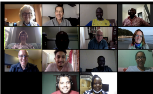
Writing Workshop - Nov, 2020

"I am now confident to write because I feel I know what to do in each section of the manuscript. Thank you for your support."