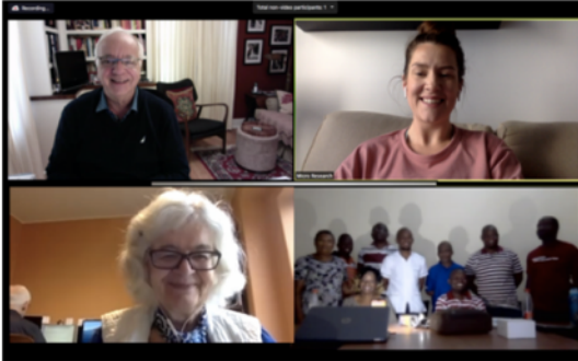
Train the Trainer for Mangochi, Malawi - Feb 2021

"Good project for capacity building in primary health care where there is usually a gap in research."