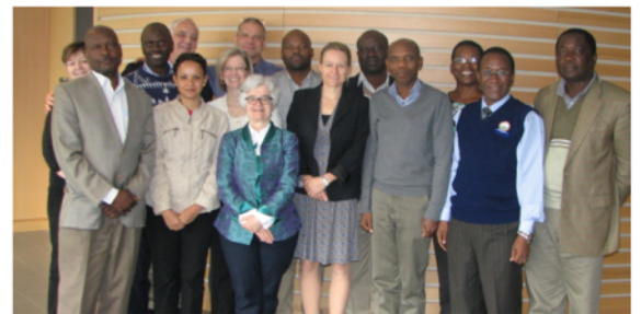
MicroResearch Strategic Planning Meeting in Toronto - 2014

We now plan to hold a Strategic Thinking meeting in November, with a mix of in-person and virtual participants. The focus will primarily be on: sustainability, accessibility, and flexibility of the program. The Strategic Thinking approach differs from traditional strategic plans as it focuses on innovative and reflective ideas from a "bottom-up" approach.