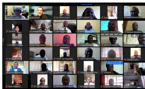
Virtual Workshop for Meru, Kenya – February, 2023