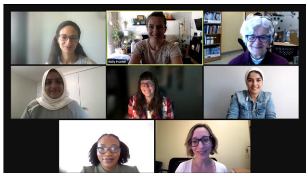
Virtual Workshop for Halifax, NS – June, 2022

This report summarizes MR activity from April 2022 to March 2023. For more information, visit the website at: http://www.microresearch-international.ca/ .